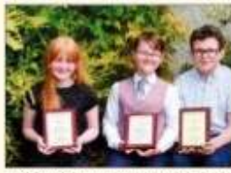
Fr Stephen Kearney Award - Newtownstewart