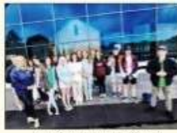
Derry Search pilgrimage - Knock