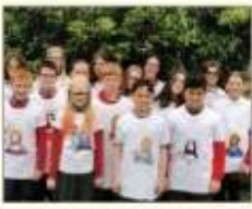
Fun the Flame - Buncrana