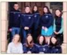
Youth Scholarship - Derry