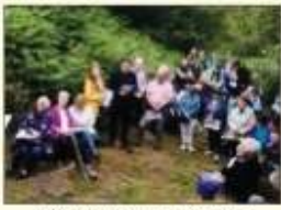
Mass Rock celebration - Gnanaghan

"They that wait upon the Lord shall renew their strength. They shall mount up with wings as eagles; they will run and not grow weary, walk and not grow weak". (Isaiah 40:31)